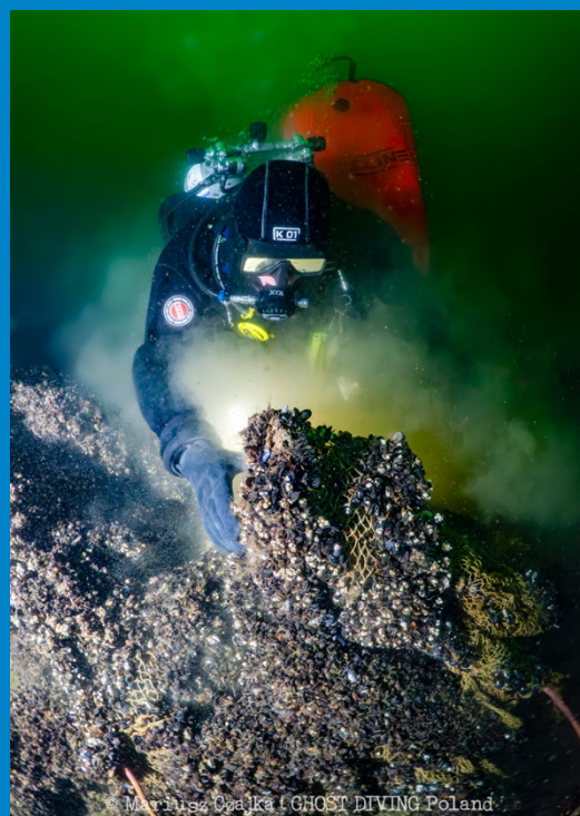
© Maziusz Czajka | GHOST DIVING Poland