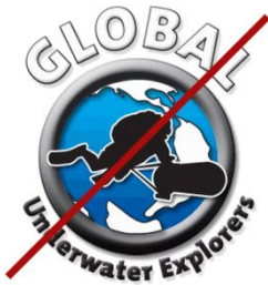
Heavily beveled logo with blue gradient