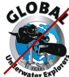
Blue 15 th Anniversary logo