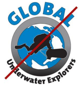
Any multi-color logo with blue text