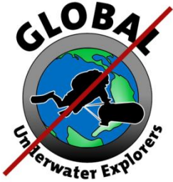
Logo with green land