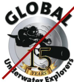
Gold 15 th Anniversary logo