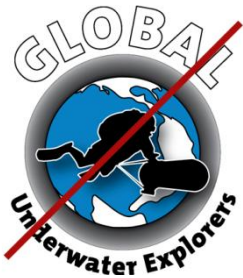
Logo with borderless globe