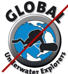
Logo with bevel, with or without a shadow