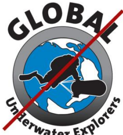
Any logo with serif font “Underwater Explorers”