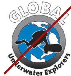
Any logo with white “Global”