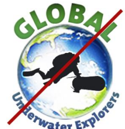
Any logo with ultra-stylized text or added textures or shading