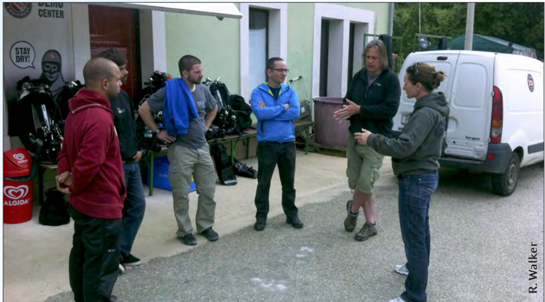
Candidates should be judicious in their use of time and resources.

4. Candidates should be judicious in their use of time and resources: Though working with several ITs/IEs has its benefits, it can also be a source of confusion for novice candidates. Individual trainers will differ in terms of focus,