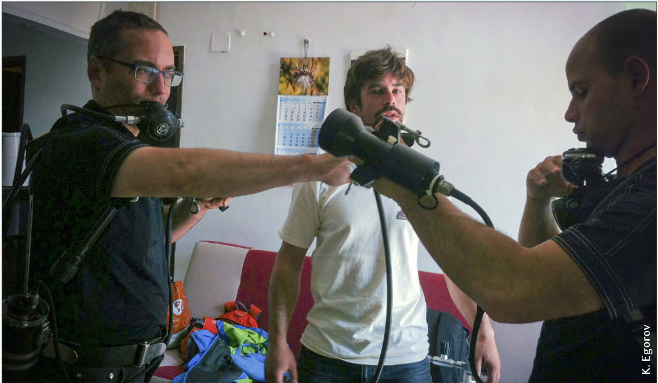
Guided by the GUE Intern Evaluation Form, candidates can work at their own pace to meet GUE's developmental outcomes.

to how I believe candidates can best meet their goals. 1 As this process is also relevant to Fundamentals instructors seeking to earn Cave 1 or Tech 1 Instructor ratings, it is vital that it is properly understood so that candidates can maximize their resources.