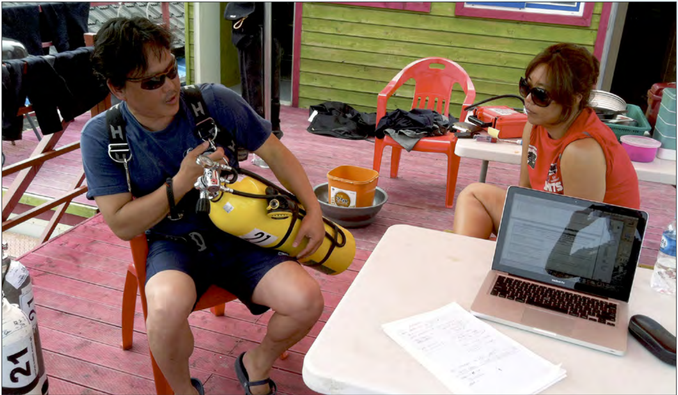
Distance-learning technologies can help candidates earn initials toward the fulfillment of their learning outcomes.

What strategy a candidate should adopt to develop aptitude and earn initials for all component parts (first signature) will depend on a number of factors; i.e., where they are based, the curriculum they are pursuing, IT/IE availability, and other factors. Here are some suggestions.